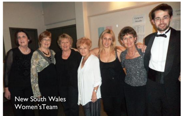
New South Wales Women's Team

New South Wales, but Western Australia trounced Queensland in that round to move into finalist position with New South Wales. In the final, New South Wales took an early lead, and the final scoreline was 186—143 IMPs.