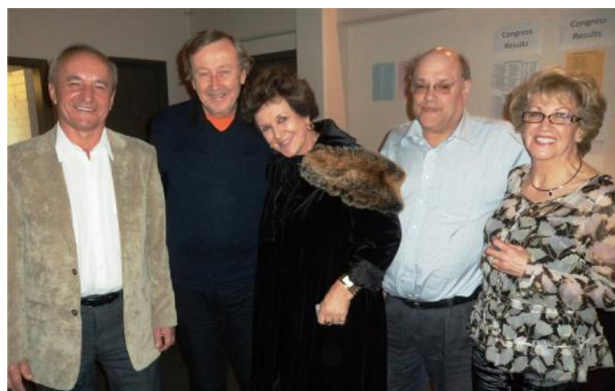
New South Wales Seniors' Team, runners up