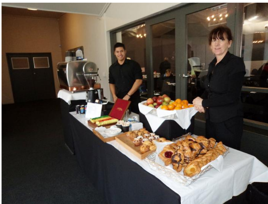
The helpful Powerhouse café staff, always on hand to make great coffee