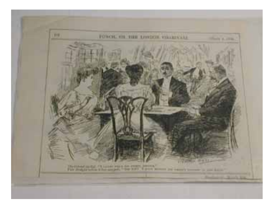
This Victorian comic is from the Postfree collection

PAUL LAVINGS' POSTFREE BRIDGE BOOKS Supporting Youth Bridge New books, software, Second hand books Check our website www.postfree.cc Visit Bridge Museum