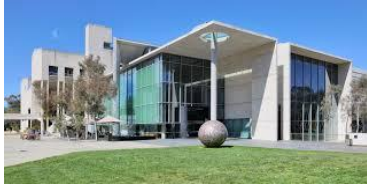
National Gallery of Australia

Take advantage of the SFOB Courtesy Bus as it will take people to exciting permanent and travelling exhibitions at many of Canberra's attractions including the Australian War Memorial, Parliament House and the National Gallery of Australia precinct once play gets under way.