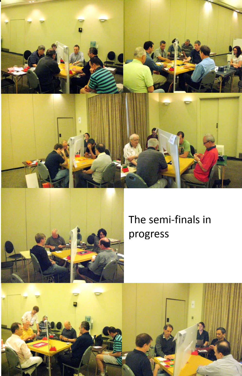
The semi-finals in progress