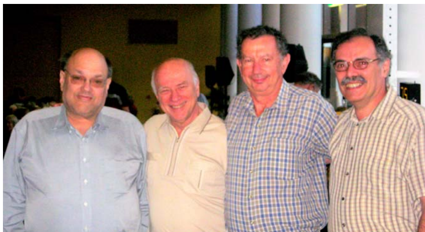
Runners-up in the Seniors' Teams were