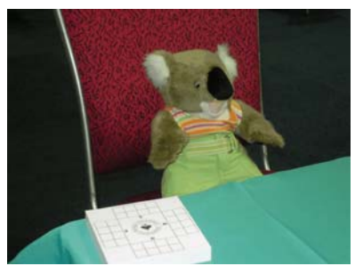
"Whadda ya mean I was doubled, mate? I make it minus 250."

At the other table N/S were allowed to play 4♠ and made it when E/W failed to obtain a diamond ruff; +620 and 15 imps to Mullamphy.