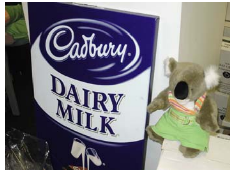
"Yeah, but I'm the Cadbury Koala."