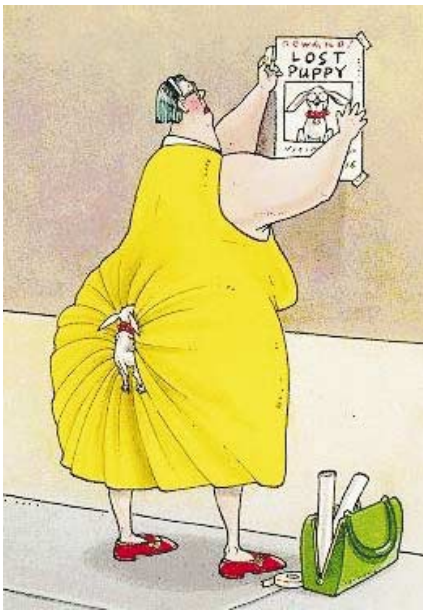
More dubious space-fillers to follow. You know what you have to do.