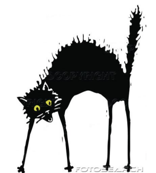
I am going to KILL the next Son of a Bitch who says I look STRESSED

Good luck & play well. ♣♠♡♠ That's me below!