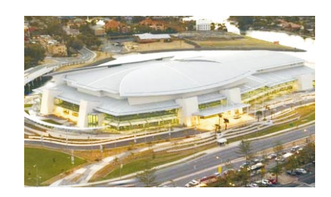
The CC is HUGE

From the Bulletin Editor: In the Pairs – Australia's last decent matchpoint event – I'd like to see individual score easily available for every pairs in every session. I'd like to see accumulated scores in percentages, not matchpoints. I'd also like to see board results posted along the lines of "Bd 22 in Final. +110 NS = 45%" It hasn't happened because this is one matchpoint ABF event, drowned by a dozen IMP events. Sigh.