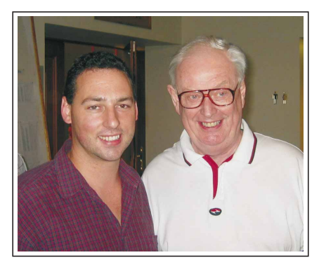
Warming up for the play-offs?

jump to 5♦, Ish pictured South with good trumps, a stiff heart and a black ace. How right he was!