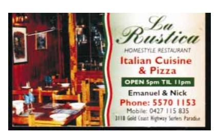
La Rustica 3118 Gold Coast Hwy