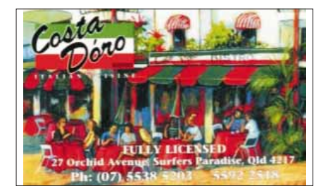
Costa D'Oro - 27 Orchid