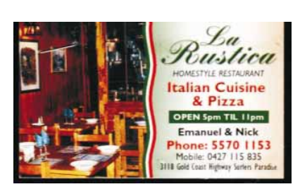
La Rustica 3118 Gold Coast Hwy