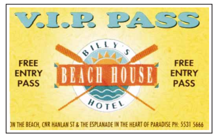
Billy's Beach House Cnr Hanlon & The Esplanade