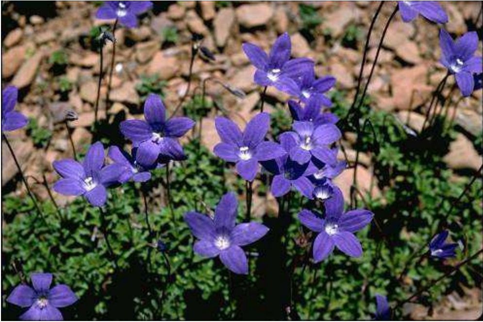
The beautiful Royal Bluebell is the floral emblem of the ACT.