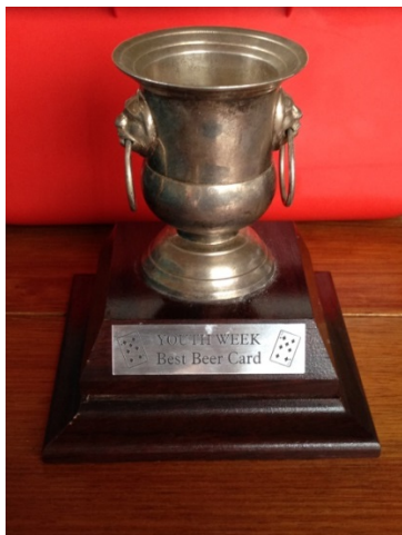
The Inaugural Best Beer Card Trophy