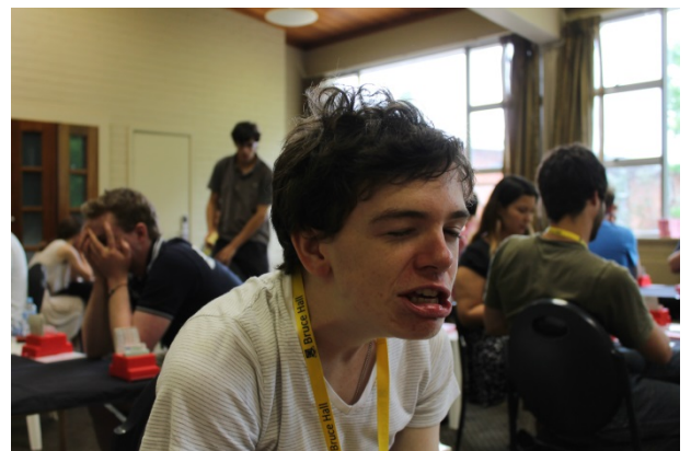
How you doin?