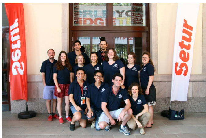
2014 Australian U25 and Girls Team