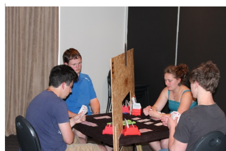
2013 Australian Youth Week