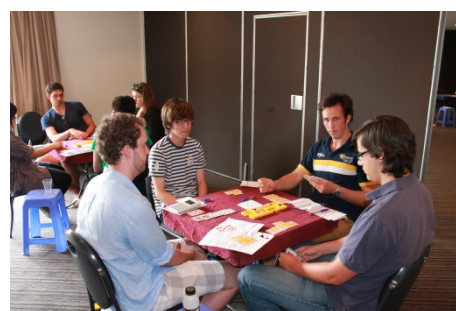
2013 Australian Youth Week