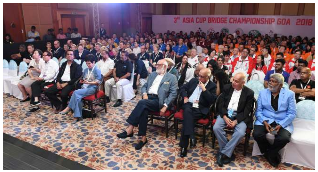
Participants and Delegates at the Opening Ceremony