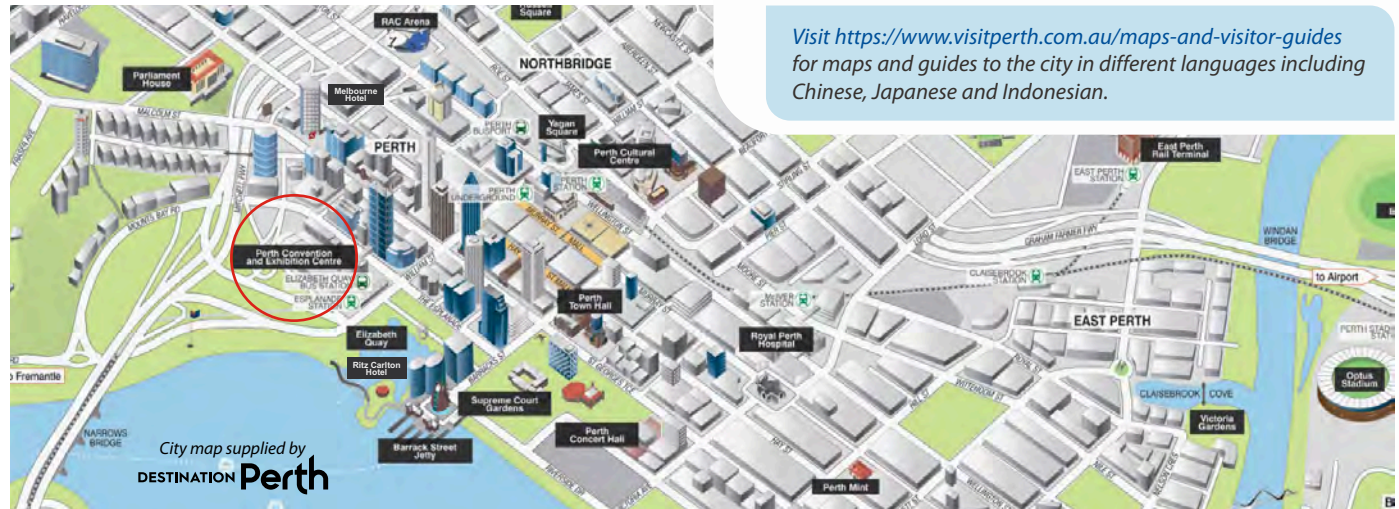
City map supplied by DESTINATION Perth

World class accommodation, restaurants, shopping and other attractions are within walking distance of the Centre. Hop on a City Cat bus to Kings Park, East Perth canals, Yagan Square and the University of Western Australia. Take a short ferry ride to Perth Zoo and the culinary delights of South Perth. Spend the evening eating out in Northbridge or at the Crown Casino.