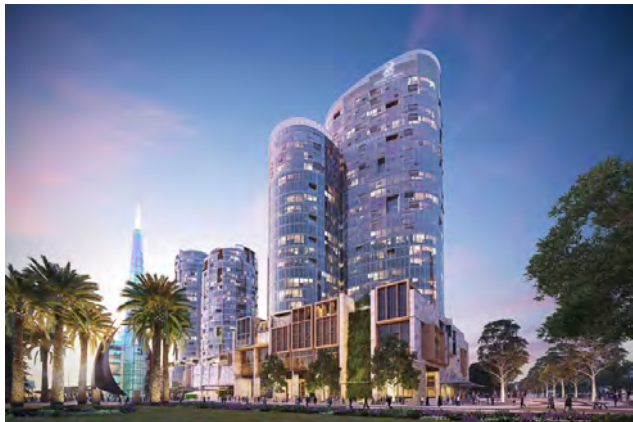
The Ritz-Carlton Hotel (10 minutes walk from venue)

Many hotels are offering special rates to APBF 2020 participants. For example: The Ritz-Carlton Perth, situated in the heart of Elizabeth Quay, will have 40 of its 204 rooms/suites available for the APBF, and the Melbourne hotel will hold 20 rooms for APBF participants.