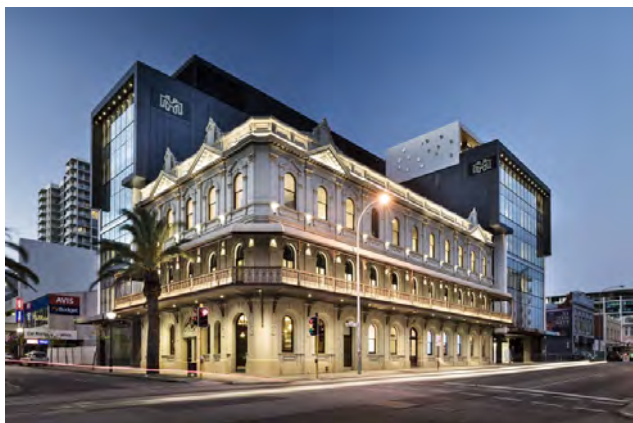
The Melbourne Hotel (10 minutes walk from venue)

See the ABF website for details and more accommodation offers: