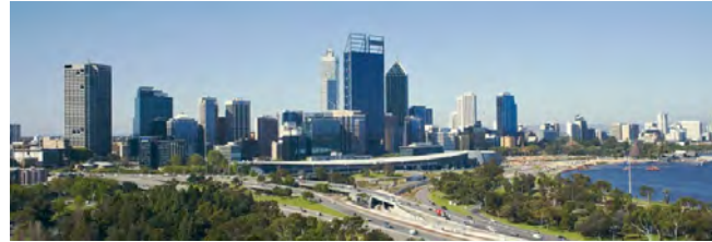
Perth City from Kings Park with Perth Convention Centre in foreground

Situated on the banks of the spectacular Swan River, and overlooked by the iconic Kings Park and Botanic Gardens, Perth is one of the prettiest and most isolated cities in the world. It boasts some of the best beaches in the world over which stunning sunsets can be seen.