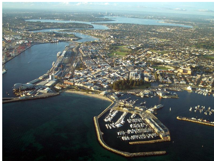
Fremantle viewed from the air