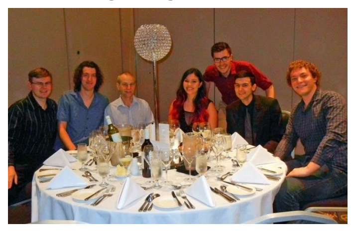
QLD Youth Team