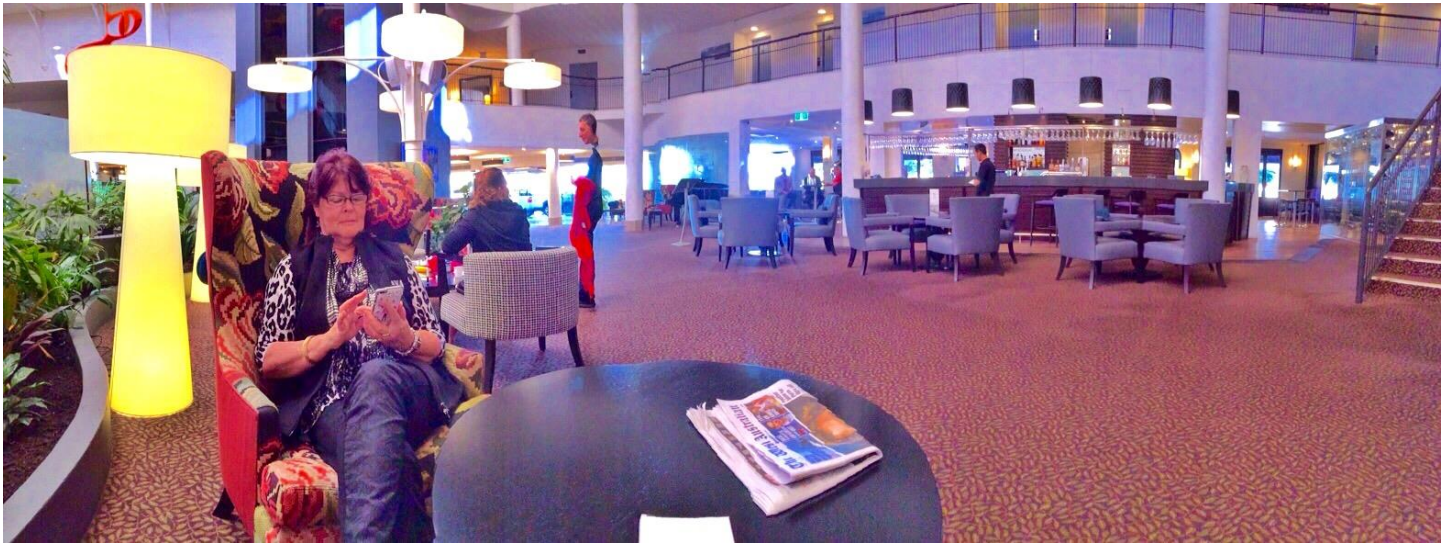
Esplanade Hotel Foyer