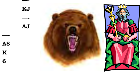
Bearing the King...

Pitch a ♣ on the ♦K and East is finished, thrown in with the bare \clubsuit A. It should be easy enough to pick East's shape, so baring the ♥K shouldn't work.