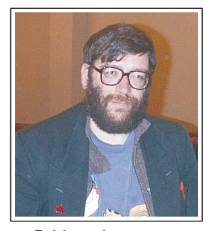
Bridge players are good at anagrams

At the other tables in the walk-in, the allowed the notrump ♠6 lead contracts to score 10 tricks. Magnus's morenic lead gave the defence five tricks (declarer went after spades, not hearts).